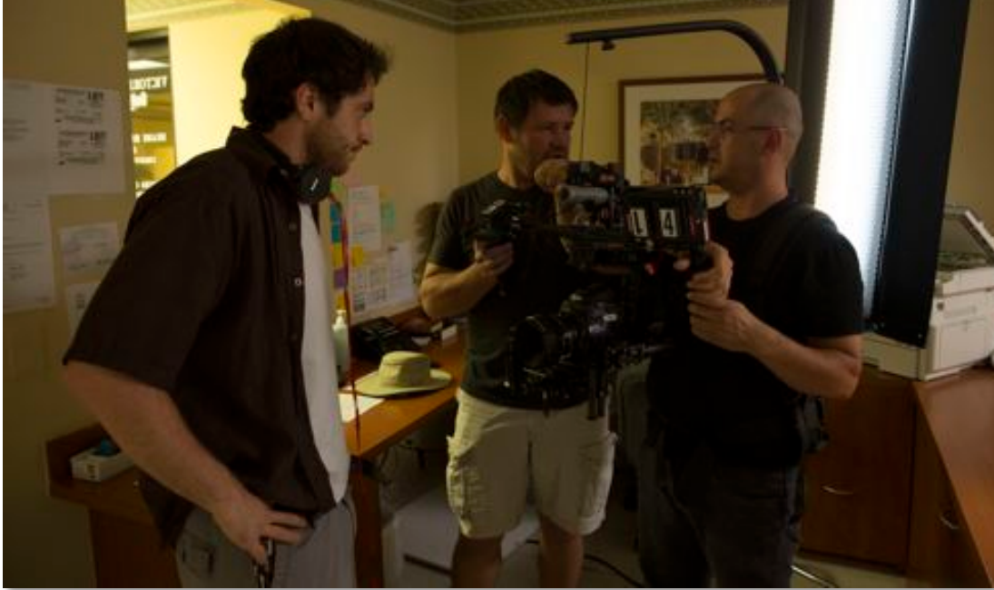
An on-set discussion about the mechanics of a shot for the infirmary scene.