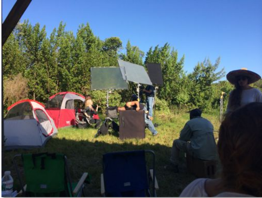
Setting up for the daylight camping scenes.