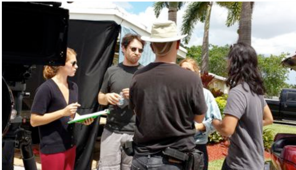
An on-set discussion about the driving sequence.