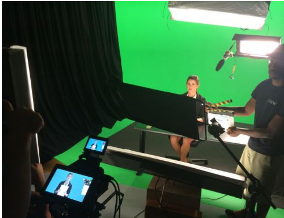
Green screen shoot for the newscast.