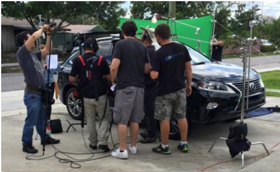
Shooting the driving sequence using green screen.