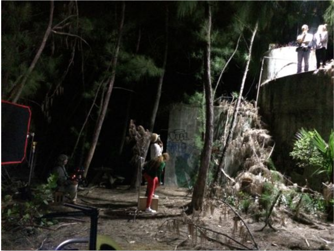
Blocking-in the lighting and setting up the final scene.