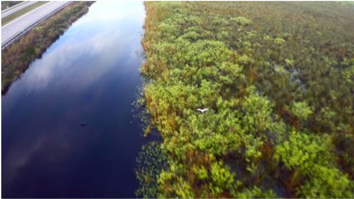
Alligator Alley in the Florida Everglades.