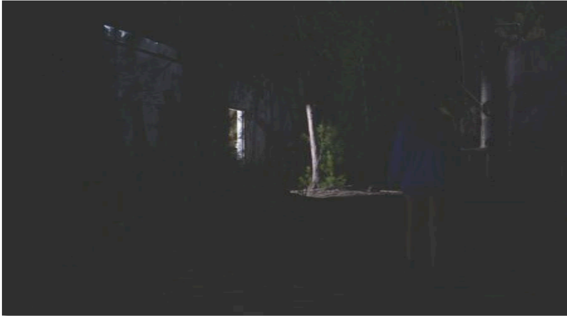
Sybil witnesses something strange during the first night at the campgrounds. (Allison Bermudez)