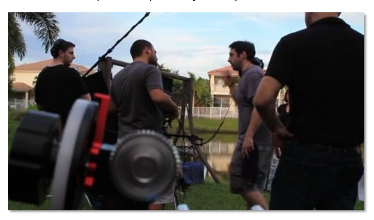
On-set discussion regarding the sound for the exterior shots.